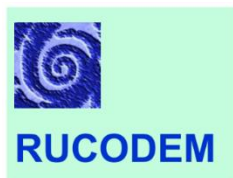
RUCODEM - Romanian Union of Cosmetics and Detergents Manufacturers