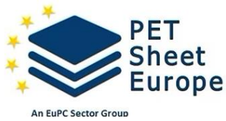
PET Sheet Europe